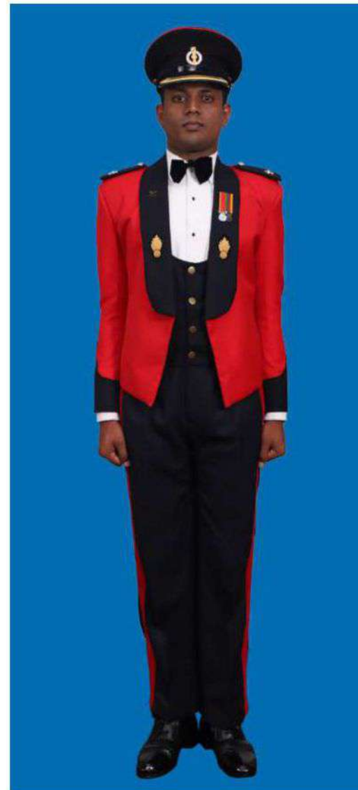
Dress No 2