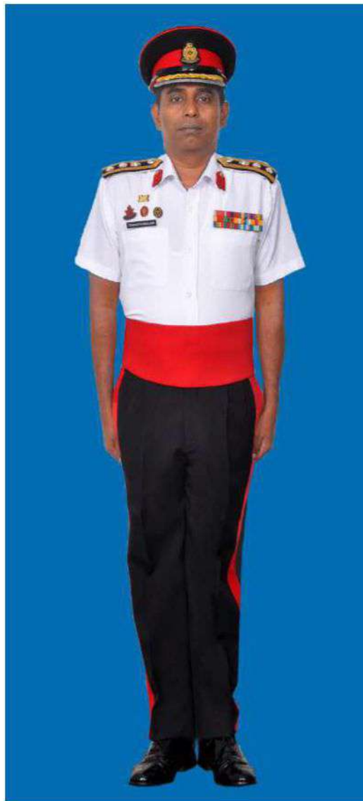
Dress No 2A