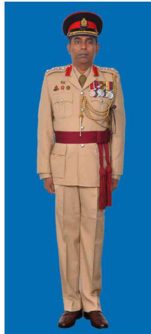
Dress No 3