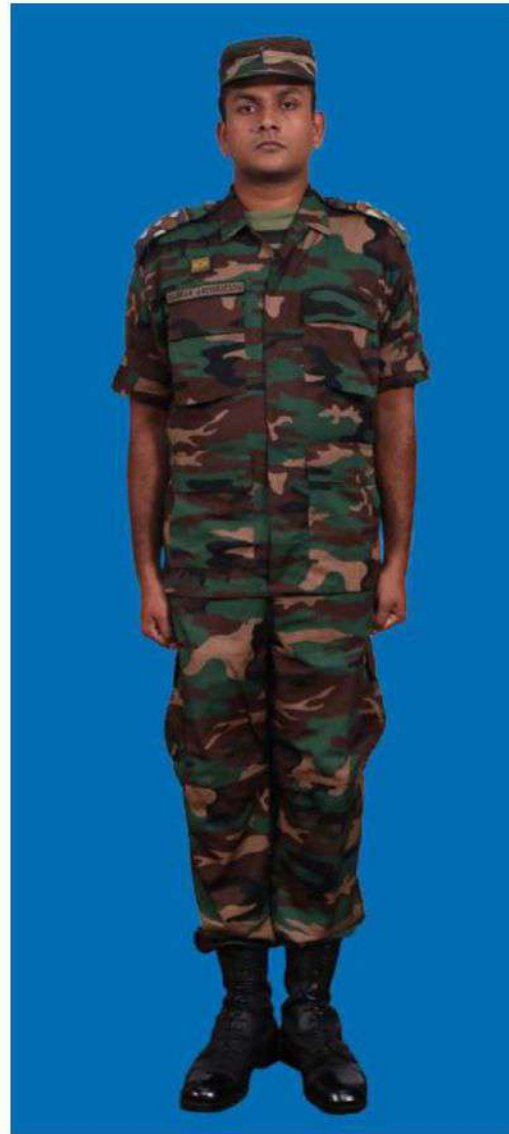
Dress No 7