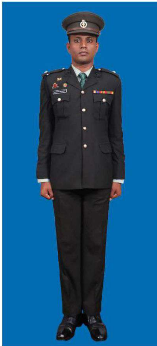
Dress No 4A