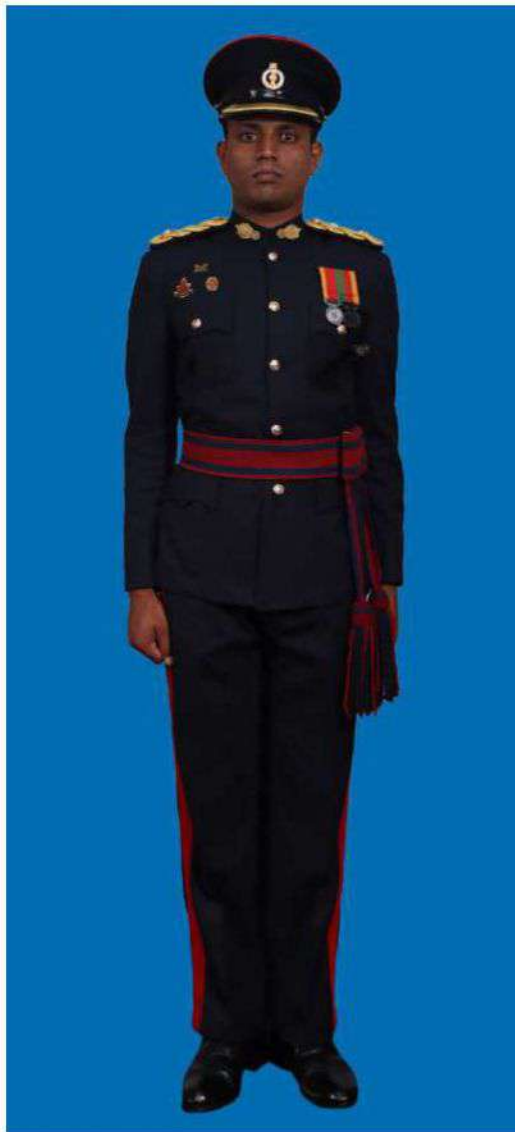
Dress No 1