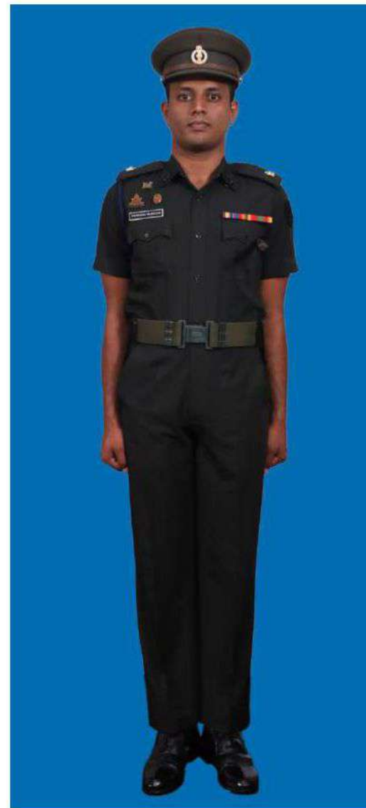
Dress No 6