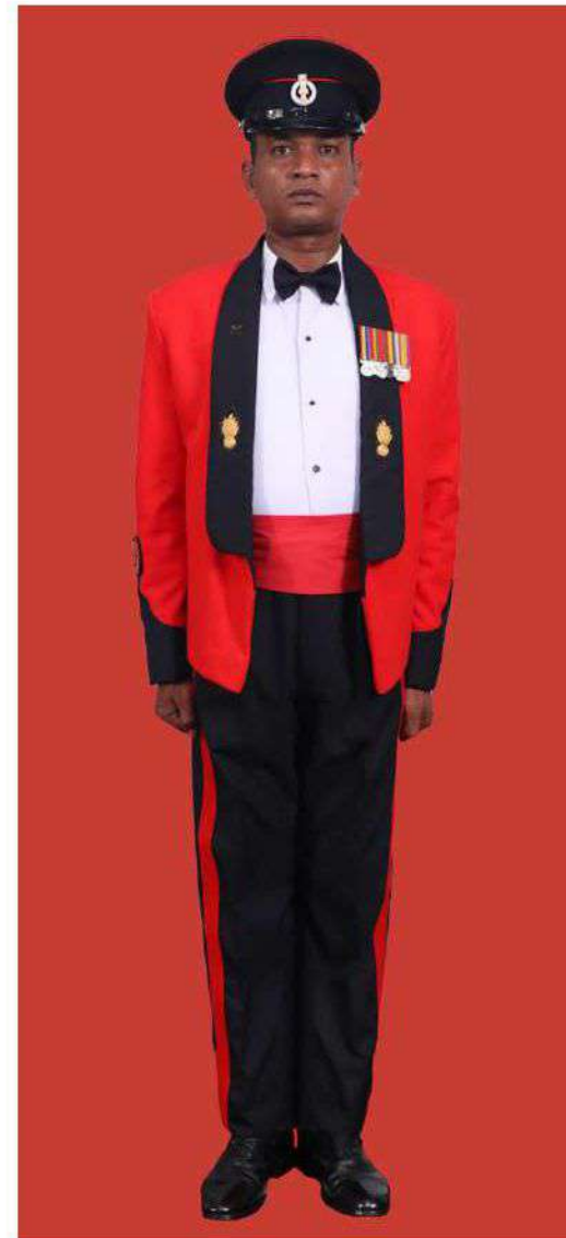
Dress No 2