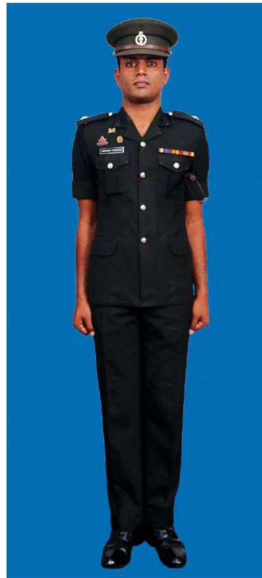
Dress No 5