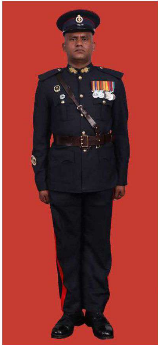
Dress No 1