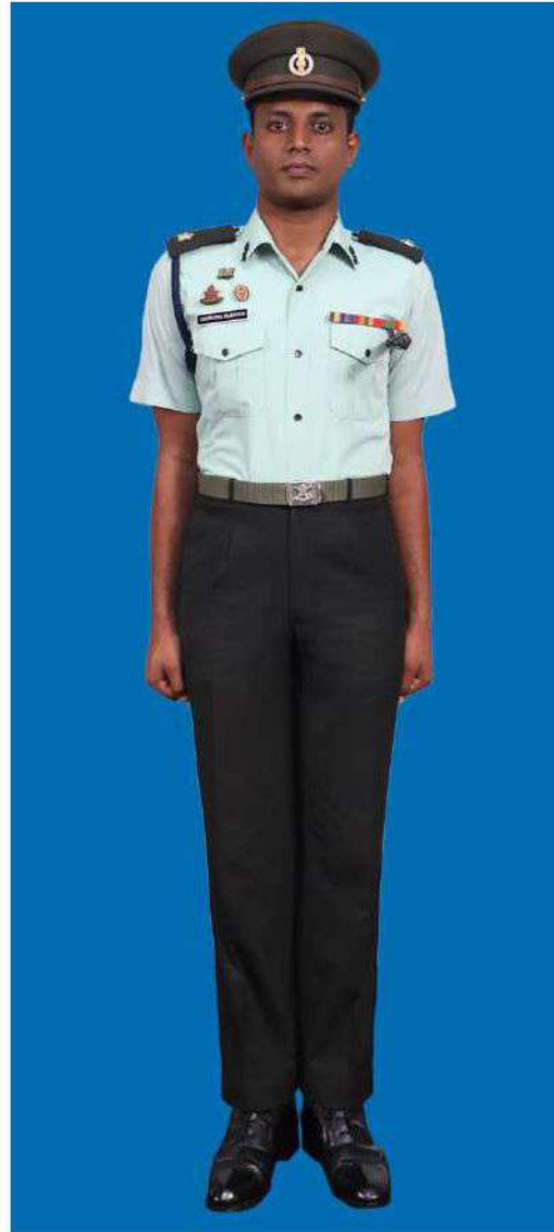
Dress No 6A