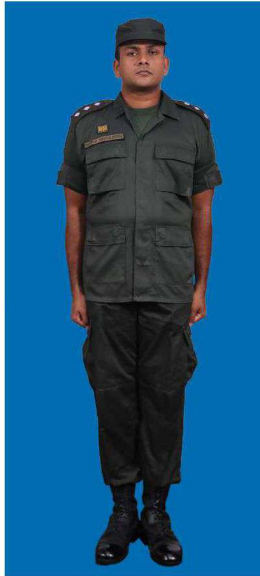
Dress No 8