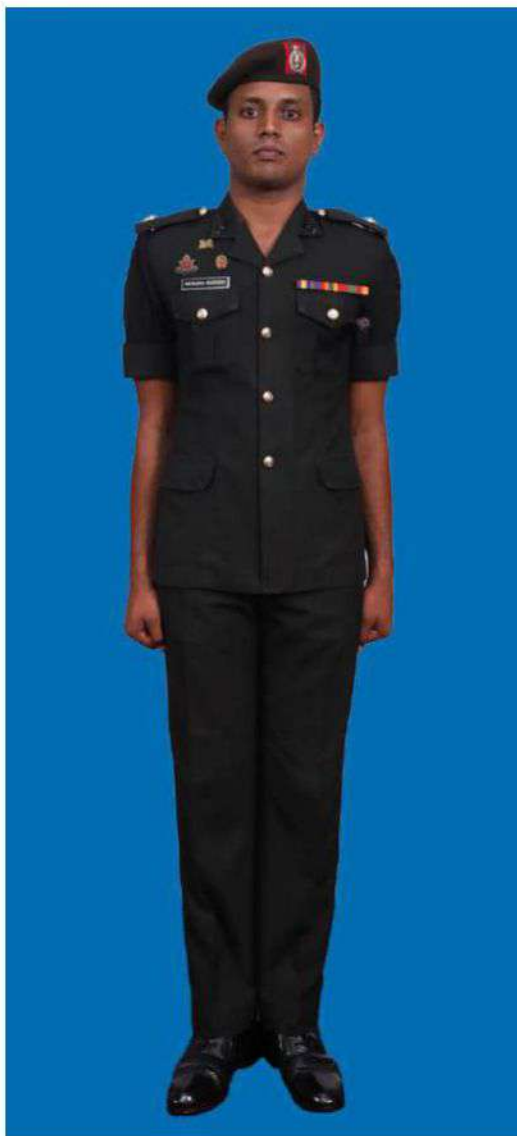
Dress No 5A