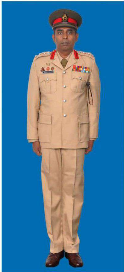
Dress No 3A